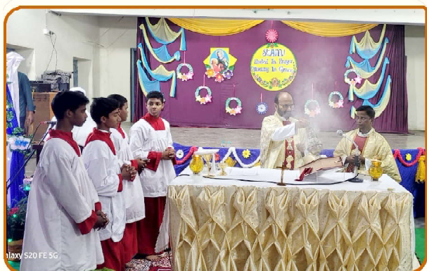
Holy Mass at St. Ann's Convent, Kazipet, on the occasion of St. Ann's Feast