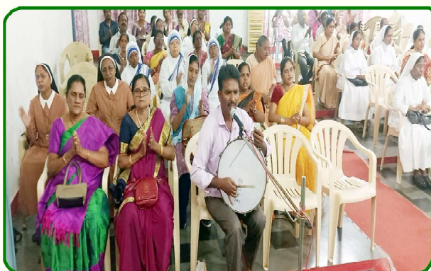
Catechists and Catechism Teachers Training Program at Pastoral Centre, Fatimanagar