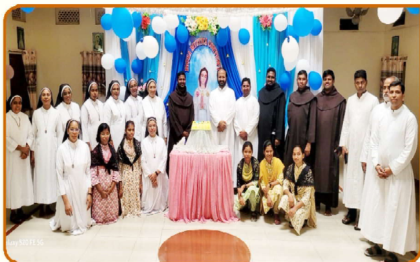
Holy Mass at Rosa Mystica Convent, Kamalapuram, on its Feast Day