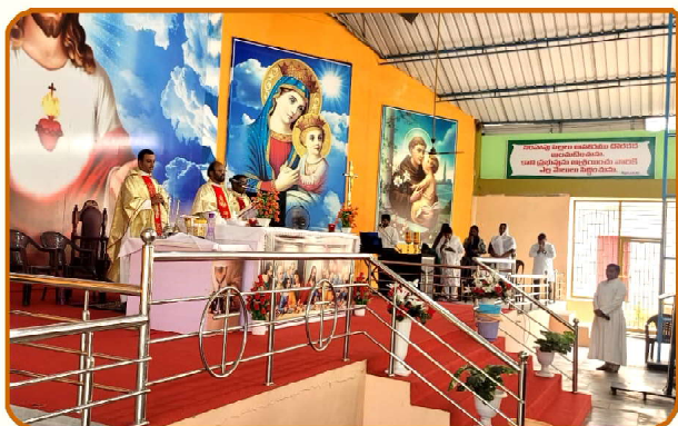
Blessing the Construction of New Adoration of Chapel and Holy Mass at Jeevadhara Prayer Centre, Rampur