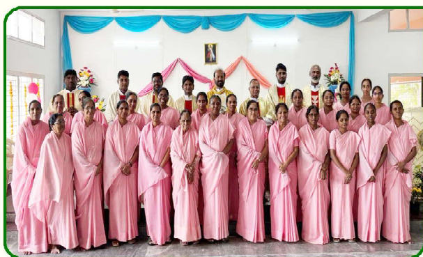
Blessing and Inauguration of St. Ann's High School Gnanamma Block - Shanthinagar