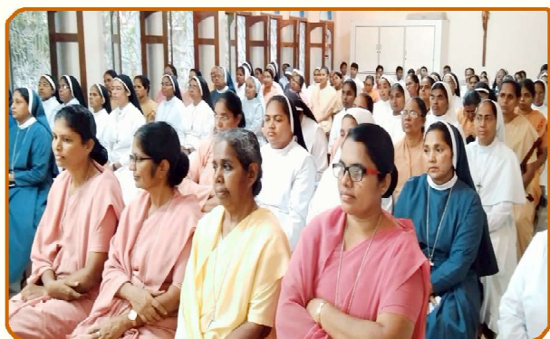
CRI General Body Meeting at Divya Deepthi Bhavan, Fatimanagar