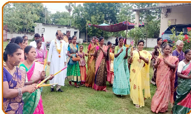
Solemnity of St. Thomas the Apostle Celebrations at Unikicherla Parish