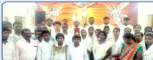
First Holy Communion and Confirmations at Subbaipally Village, Waddepally Parish