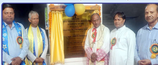
Inauguration of New School block at St. Gabriel High school, Fatimanagar