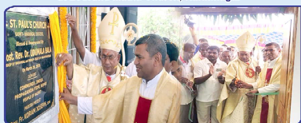
Church Blessing at Saipet Village