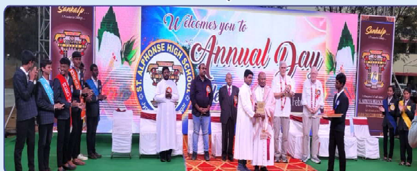
St. Alphonse High School Annual Day celebration, Karimnagar