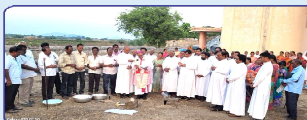
Laying foundation stone for Construction of new church at Gudur Village