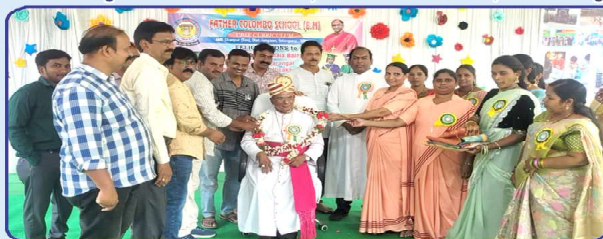
Graduation Ceremony at Father Colombo CBSE School, Ghanpur