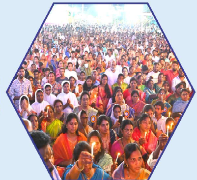
Candle Lit -Eucharist Procession & Benediction