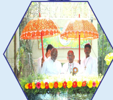
Pontifical High Mass