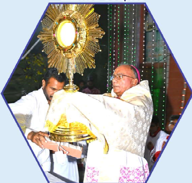
Candle Lit -Eucharist Procession & Benediction