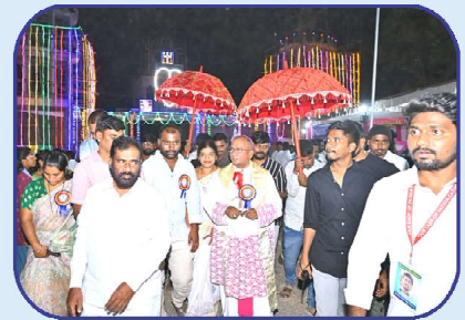
Grand Marian Procession