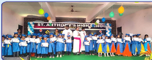
Graduation Ceremony at St. Anthony's High School, Karimnagar