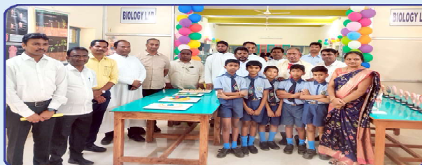
6 Visit to St. Mother Teresa School and B.ed College, Blessing of the Science Labs, Basketball Courts, Fatimanagar