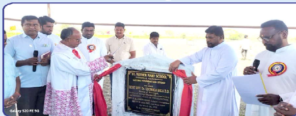
Foundation Stone Blessing and Graduation Ceremony at St. Mother Mary School, Kaleshwaram