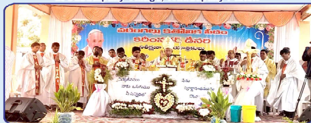
Karimnagar Deanery Jubilee 2025 Celebrations at Lourdu Matha Church, Karimnagar