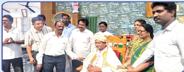
Holy Mass at St. Joseph's Church, Kazipet Parish