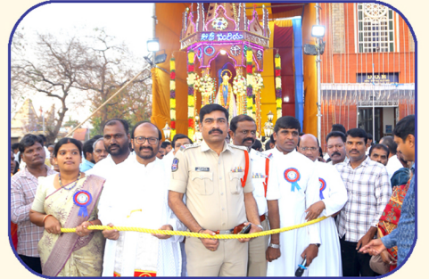
Grand Marian Procession