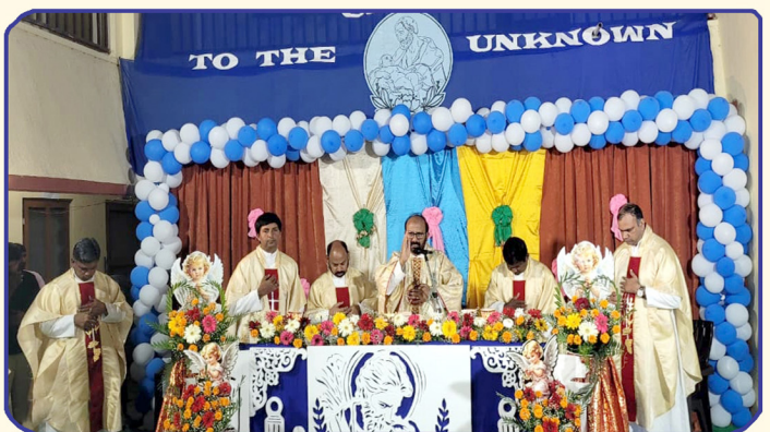
St. Joseph Feast Celebrations at Baktha Yosepu Nilayam Mill Hills Formation House, Karunapuram