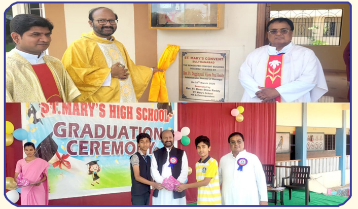
Graduation Ceremony and Blessing of the Renovated St. Mary's Convent, Sultanabad