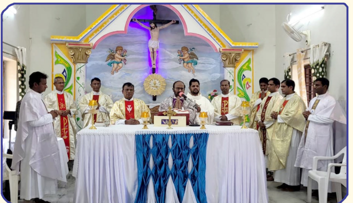
Dinam Mass at Shabad