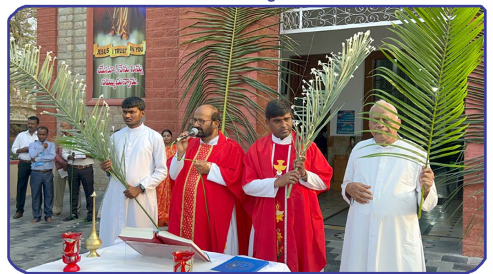
Holy Week Palm Sunday-Passion Sunday-Holy Mass at Fatima Cathedral