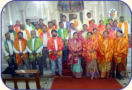
Honouring Catholic Sarpanches and Upa-Sarpanches