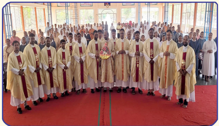
CRI Lenten Recollection at Jeevadhara Prayer Centre, Rampur