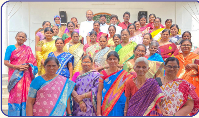
Holy Mass at Dacharam Parish