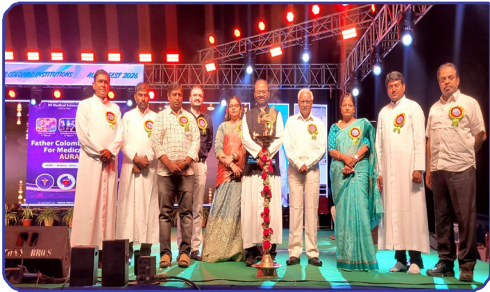
AURA Fest at FCIMS Campus, Warangal