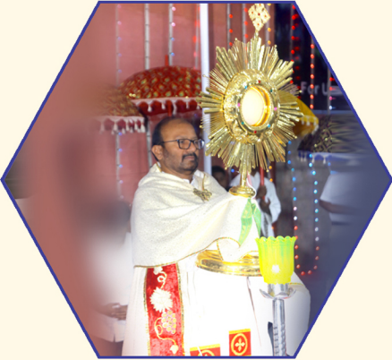
Candle Lit -Eucharist Procession & Benediction