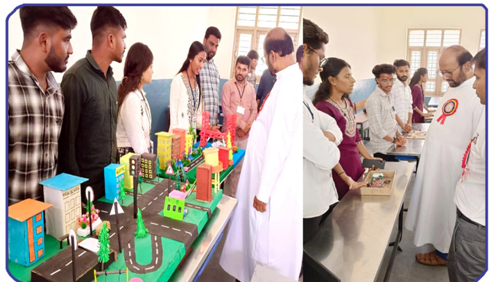
TECHNO ZEAL at CIJTS, Jangaon