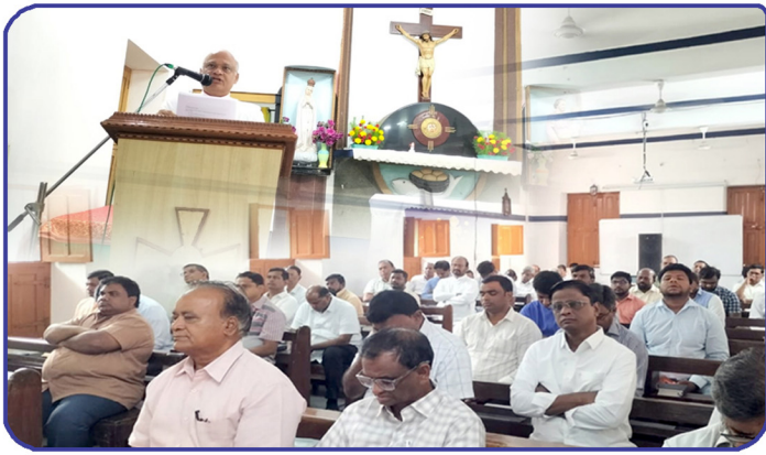
Warangal Clergy Lenten Recollection & CHRISM Mass, Fatimanagar