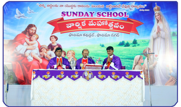
Sunday School Annual Day Celebrations Fatima Cathedral, Fatimanagar