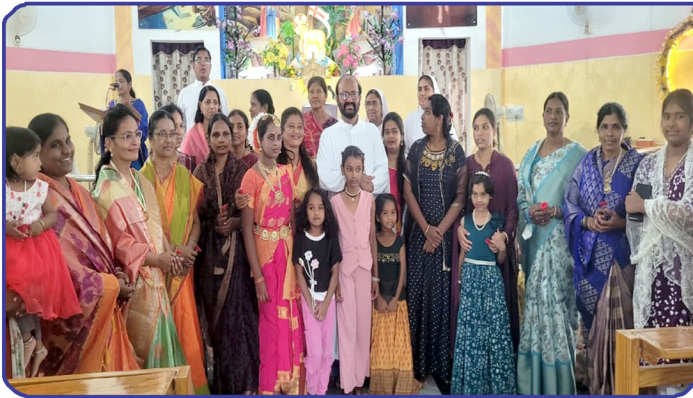
Holy Mass at Kumarapally Parish