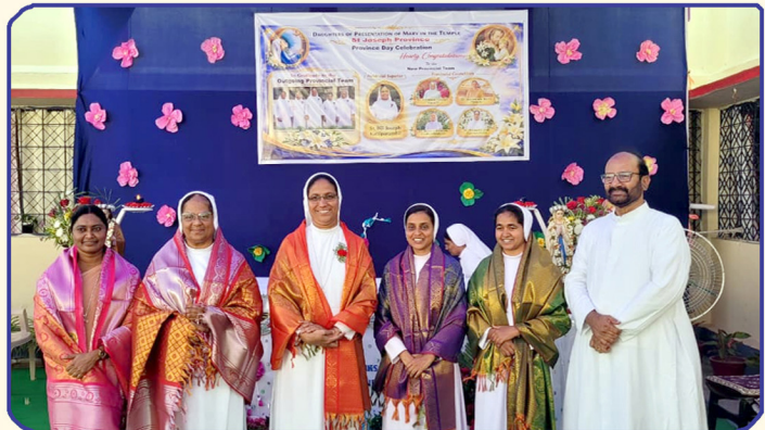
Solemnity of St. Joseph's Holy Mass at Presentation Provincialate, Fatimanagar