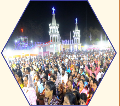
Candle Lit -Eucharist Procession & Benediction