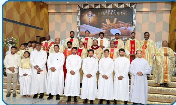
Final Profession of Montfort Brothers at Hyderabad