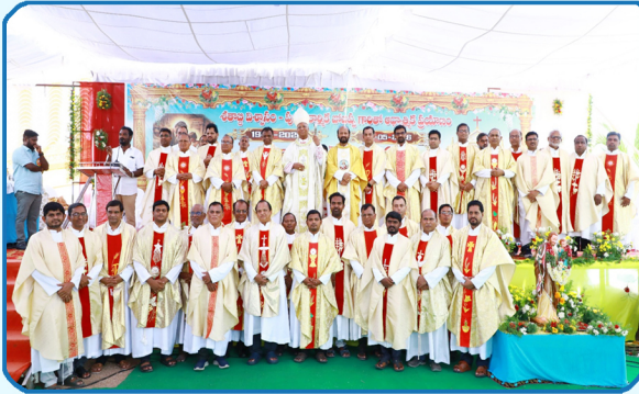
Centenary Celebrations of St. Joseph's Catholic Church, East Nidigonda, Jangaon Parish