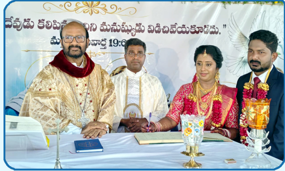
Holy Matrimony at Agapet Village, Narmetta Parish