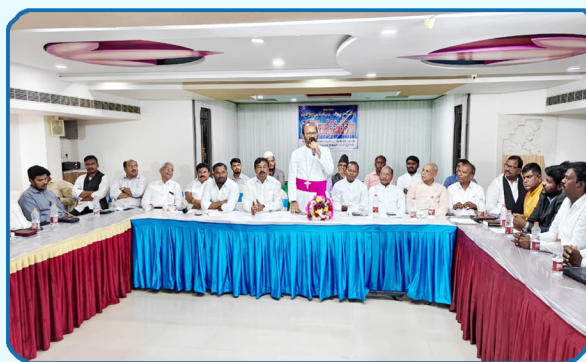
SC, BC Commission Round Table Meeting, Fatimanagar