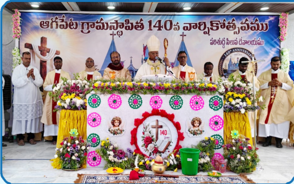
140 th Anniversary of Catholic Presence of Agapet Village, Narmetta Parish