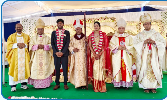
Holy Matrimony at Ramachandrapuram Village, Palakurthy Parish