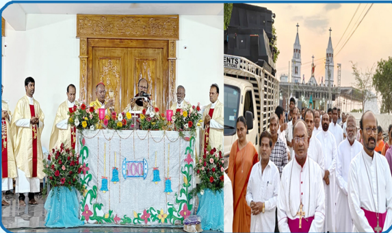
Holy Mass & Procession at Gudur Village