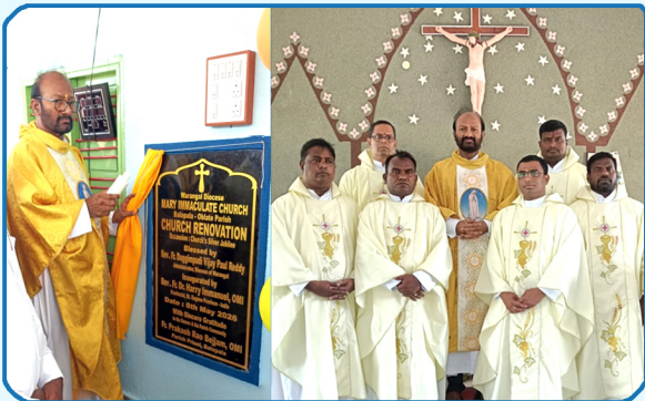
Silver Jubilee Celebrations of Balapala Parish