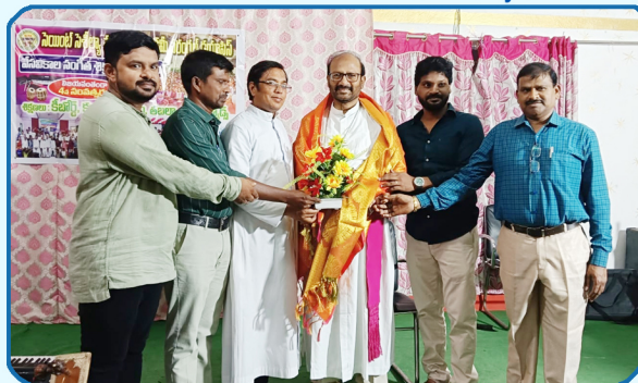
SCMA Summer Music Course Valedictory Ceremony, Fatimanagar