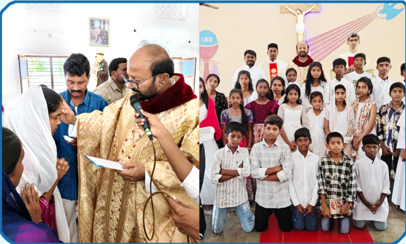
Confirmations & First Holy Communion at Atmakur Parish