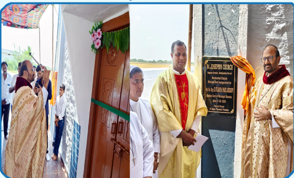
Blessing the Renovated Chapel at Jaggaigundla Village, Reddipalem Parish