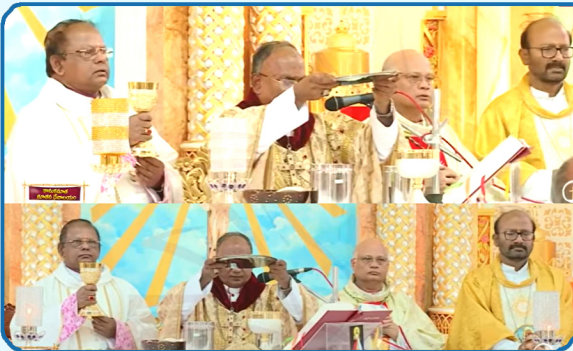
Blessing & Dedication of New Chapel at Gudur Village