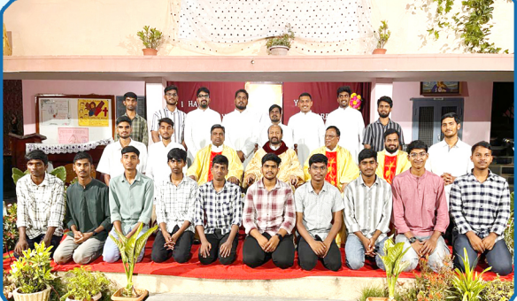
Meeting with Seminarians Karunapuram