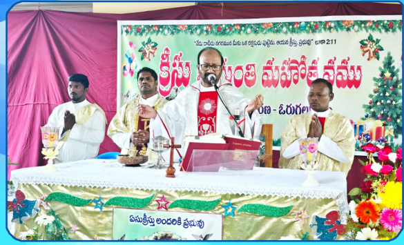
Christmas Day Mass at Dharmasagar Parish