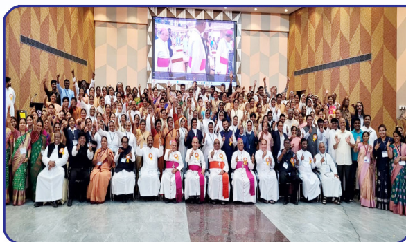
Seminar for Catholic Education Leaders Conducted by TCBC, Hyderabad