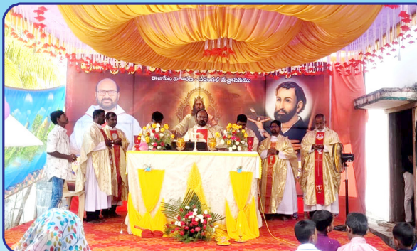
Feast of St Francis Xavier- Feast mass at Rajupet Parish