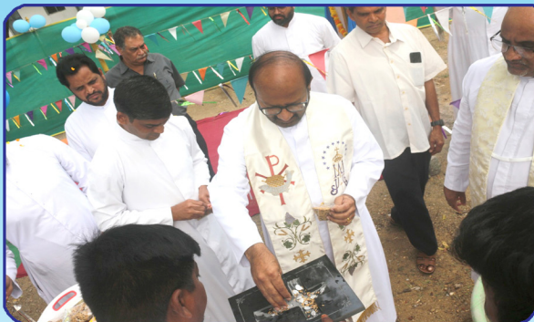
Blessing and Laying of the Foundation Stone for the new building of Holy Cross, Ghanpur