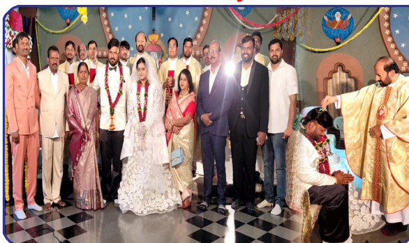
Holy Matrimony at Veleru Parish