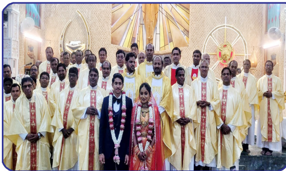
Holy Matrimony at Bandlaguda, Archdiocese of Hyderabad