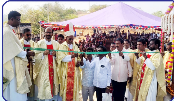
Banjara Christmas Celebrations at Yesugutta, Mahabubabad