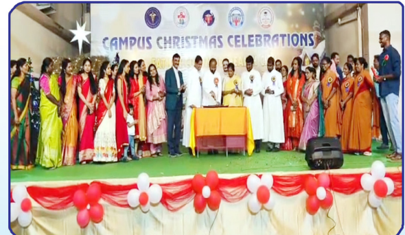
Pre-christmas Celebrations at Father Colombo Health City