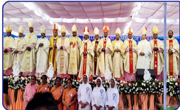
St. Ann's Congregation 150 Years Celebrations at Phirangipuram, Guntur Diocese