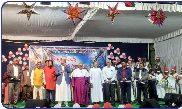
United Mega Christmas Celebrations at Public Garden, Hanumakonda