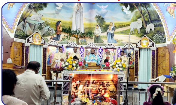
Immaculate Conception Church Feast Celebrations at Subedari Parish