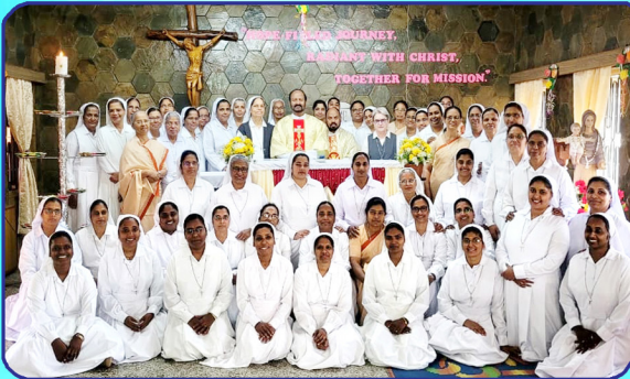
Provincial Chapter of Mary Mediatrix Congregation, Holy Mass at Mary Mediatrix Convent, Karunapuram