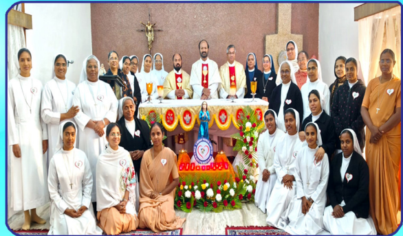
Provincial Chapter Meeting of DPMT Sisters, Inaugural Mass at Karunapuram