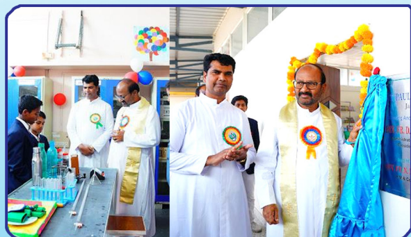
Pre-Christmas Celebrations and Opening of Library & Labs at St. Paul's High School, Jangaon