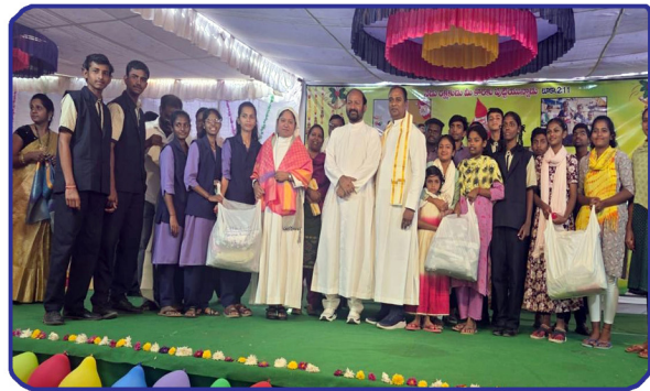
Pre-Christmas Celebrations at LODIMSSS, Fatimanagar