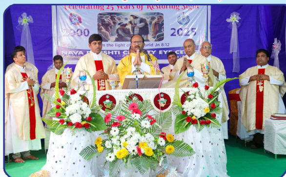
Silver Jubilee Celebrations of Nava Drushti Eye Hospital, Fatimanagar