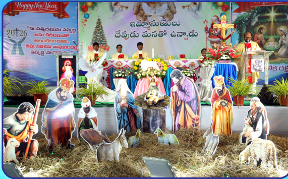
Christmas Vigil Mass at Fatima Cathedral