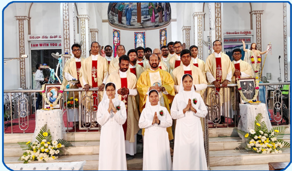
Final Profession of DPMT Sisters at Fatima Cathedral