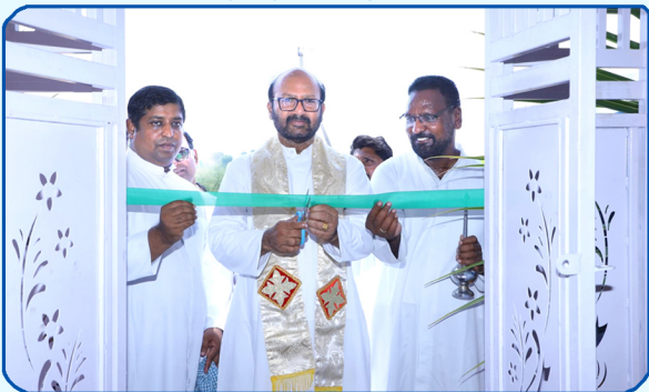
Blessing and Inauguration of Kaleshwaram School Building, Kaleshwaram