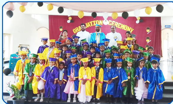
Graduation Ceremony at Father Colombo CBSE School, Ghanpur