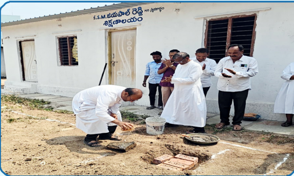
Ground Breaking Ceremony for New Presbytery at Jangaon Parish