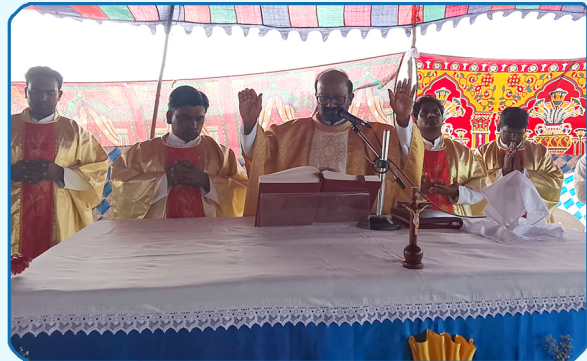
Day Mass at Dharmasagar Hill-Top