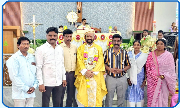
Feast Celebrations of St. Peter's Church, Waddepally Parish