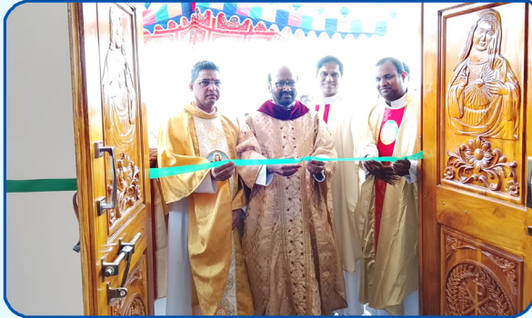
Blessing and Dedication of New Chapel at Bandavuthapuram Village, Reddipalem Parish