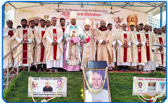
Golden Jubilee Celebrations of Singaram Parish